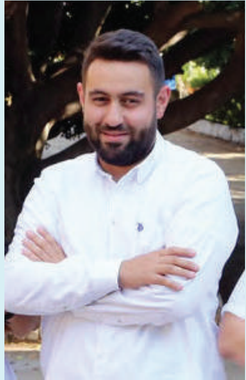
Elias El Murr Alumni Association

To all members of the JM Community, As Board of the Alumni Association of Jesus & Mary School, we proudly support our alma mater and cherish the theme Learn to love, love to learn. Our school shaped us in many aspects, and we stay connected to the school by supporting current students and celebrating achievements. Together, let us continue to make a positive impact and leave a lasting legacy.